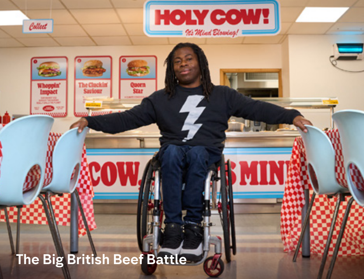
The Big British Beef Battle

Channel 4 Sales was the first commercial team within a major UK broadcaster to provide advertisers with emissions data, in partnership with Scope3 – helping to reduce the carbon footprint of media campaigns.