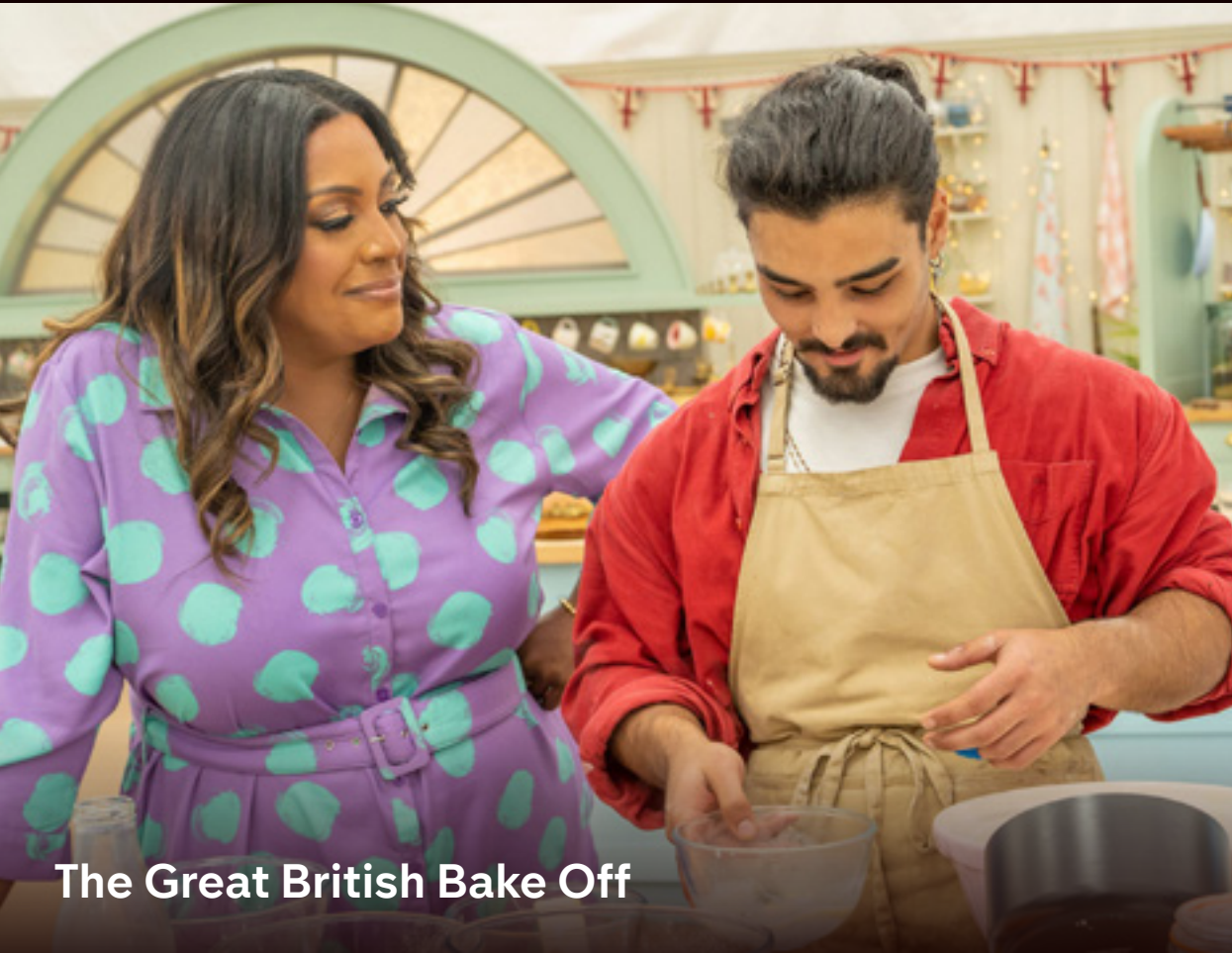
The Great British Bake Off