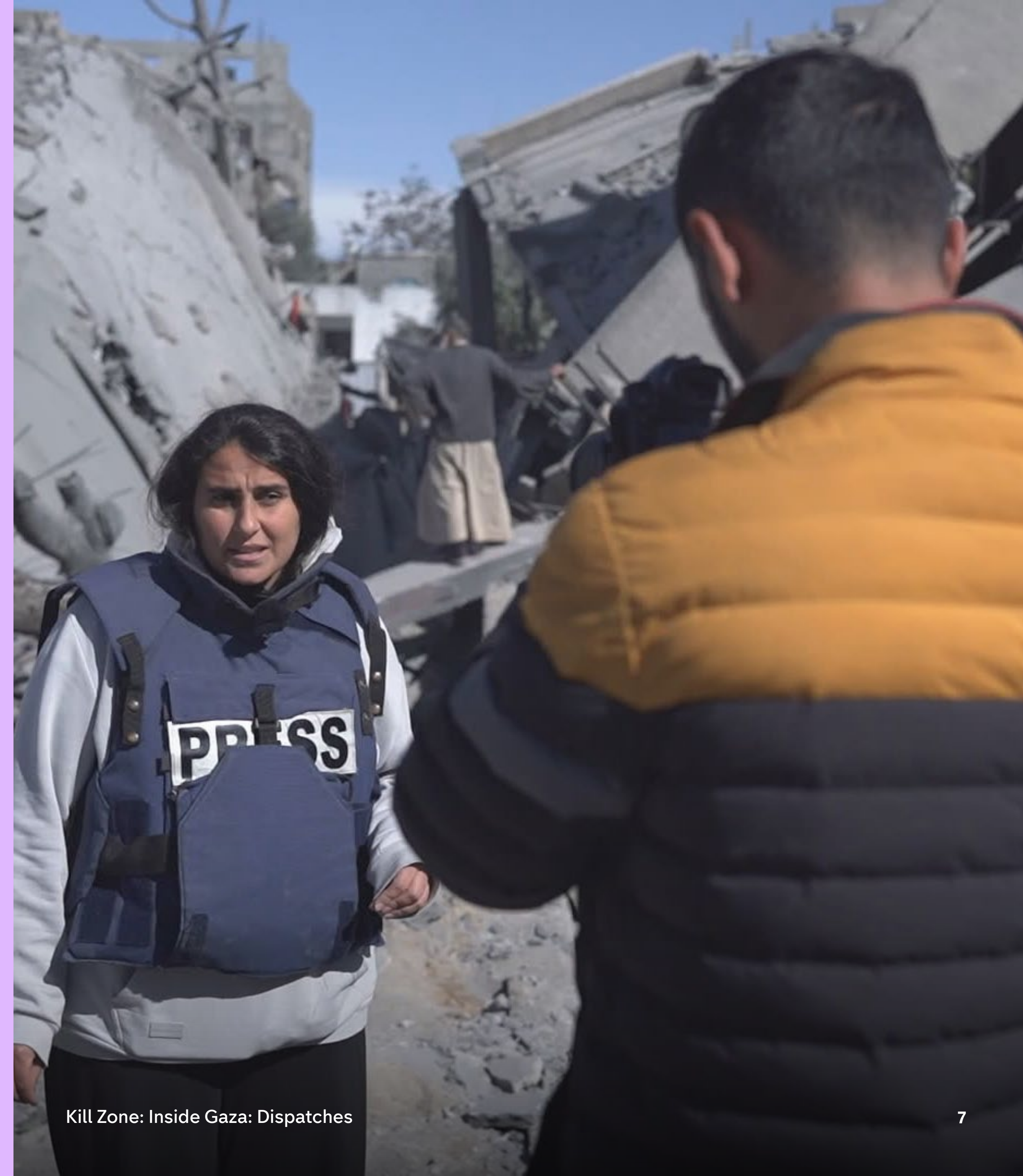
Kill Zone: Inside Gaza: Dispatches