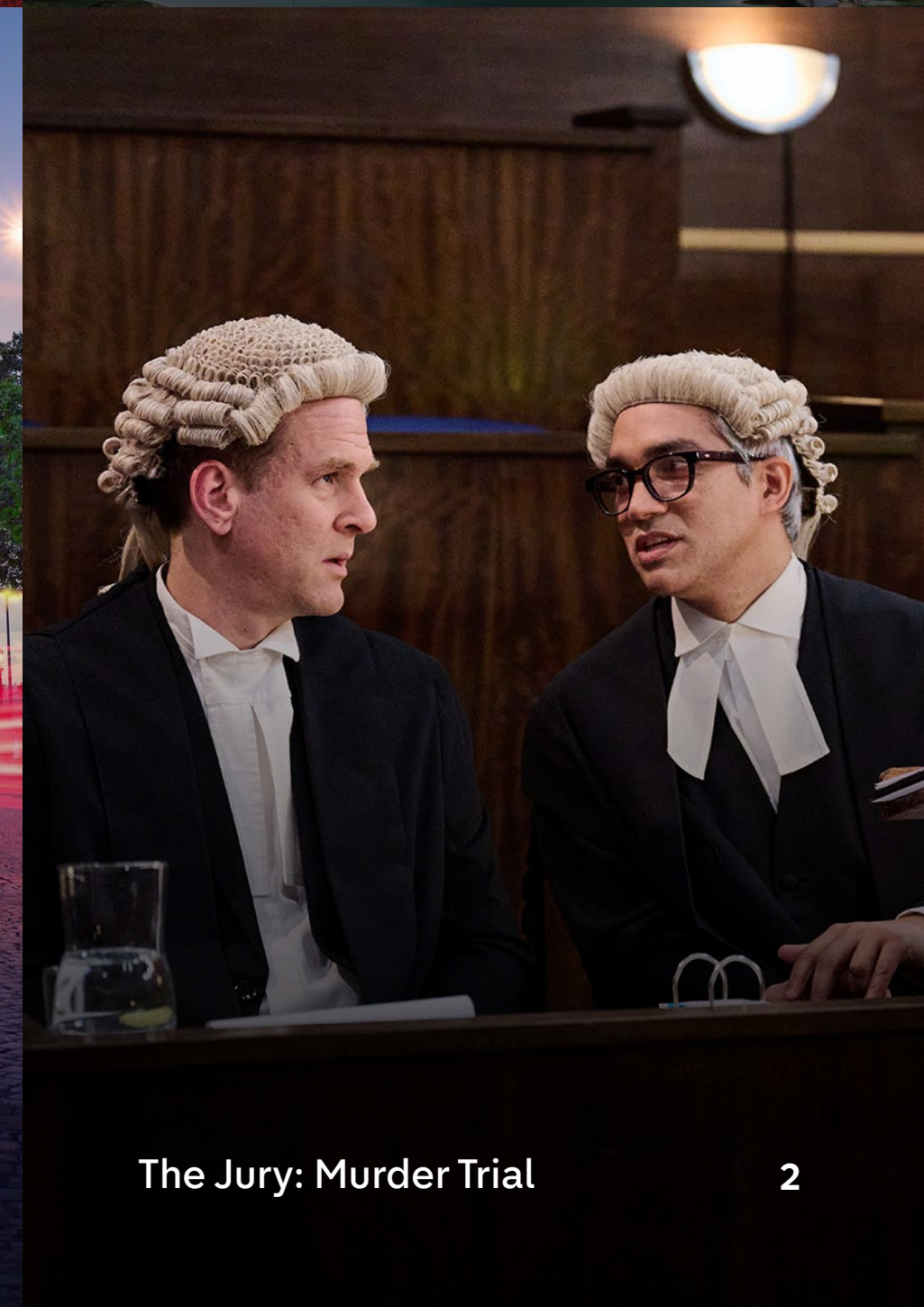
The Jury: Murder Trial