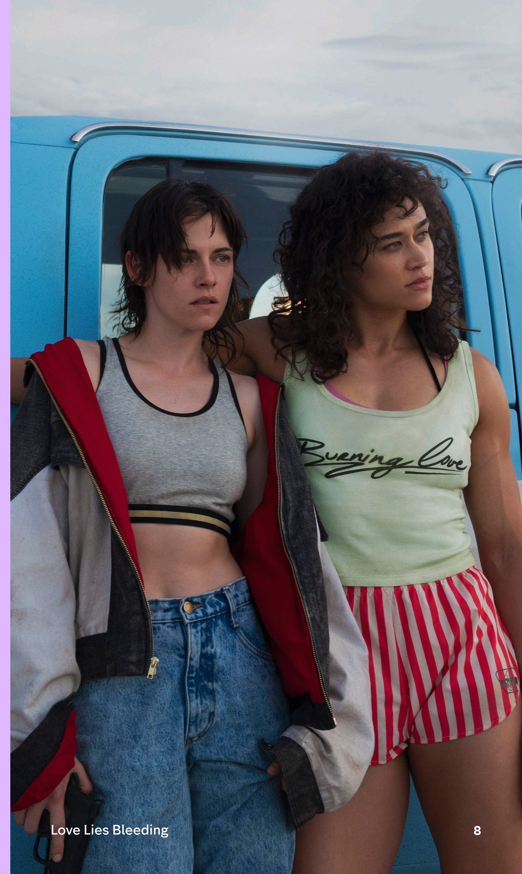
Love Lies Bleeding

Hard Truths – Michele Austin Best Supporting Actress