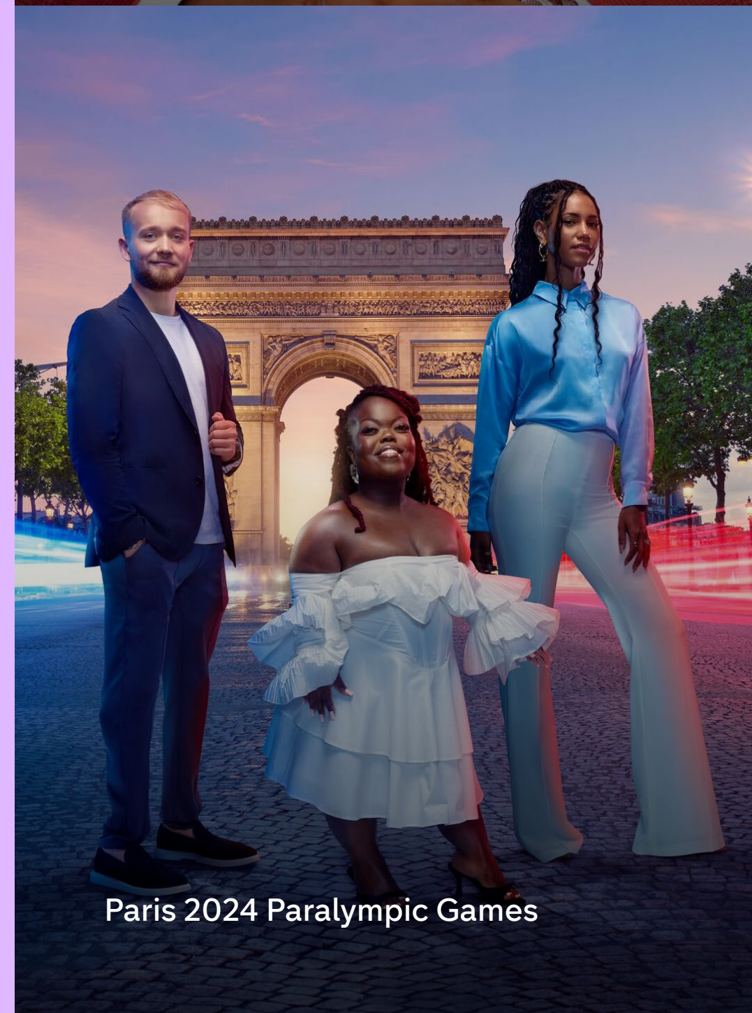
Paris 2024 Paralympic Games