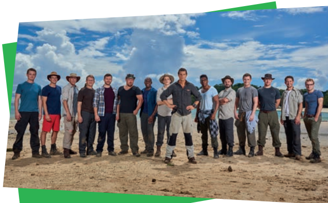
The Island with Bear Grylls – Series 2