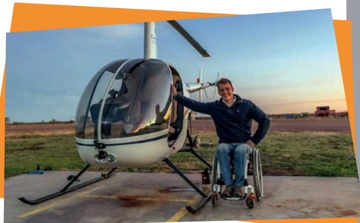
Flying to the Ends of the Earth