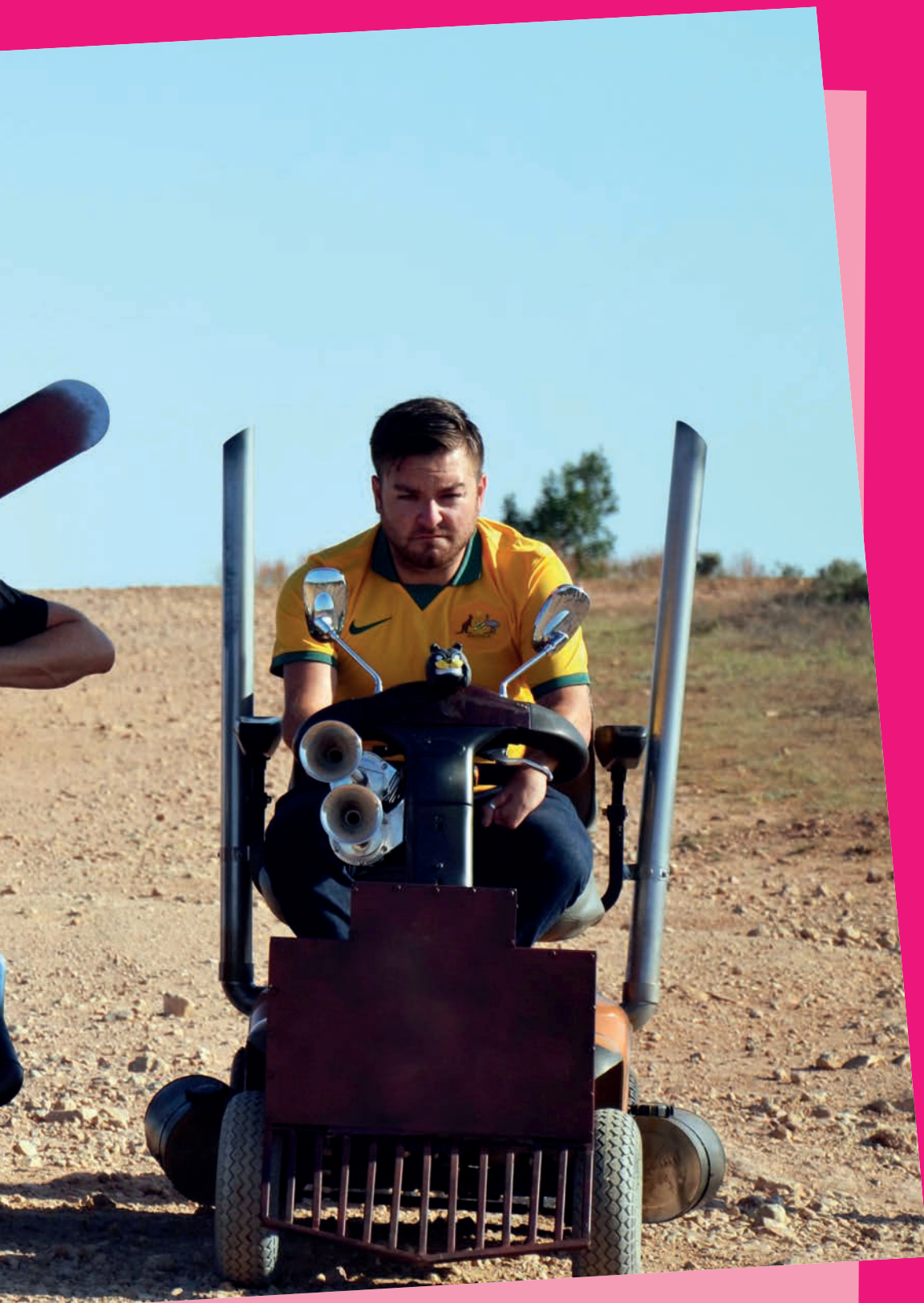
The Last Leg Goes Down Under