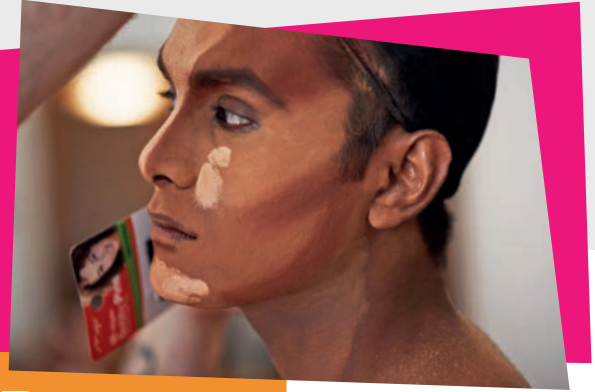
Muslim Drag Queens

Channel 4 shows Britain the way it is – full of difference and variety