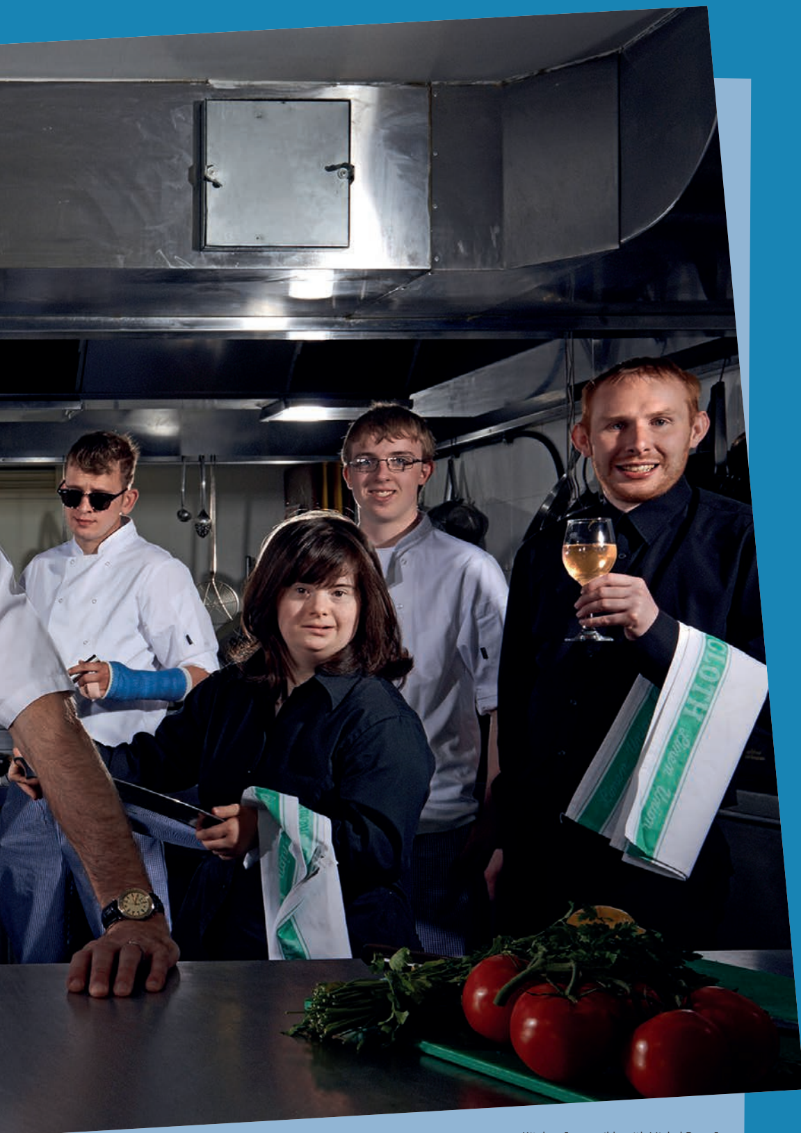
Kitchen Impossible with Michel Roux Jr