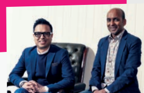
Voltage TV Productions: Indie Growth Fund 2015 investee

to production companies with a significant BAME shareholding