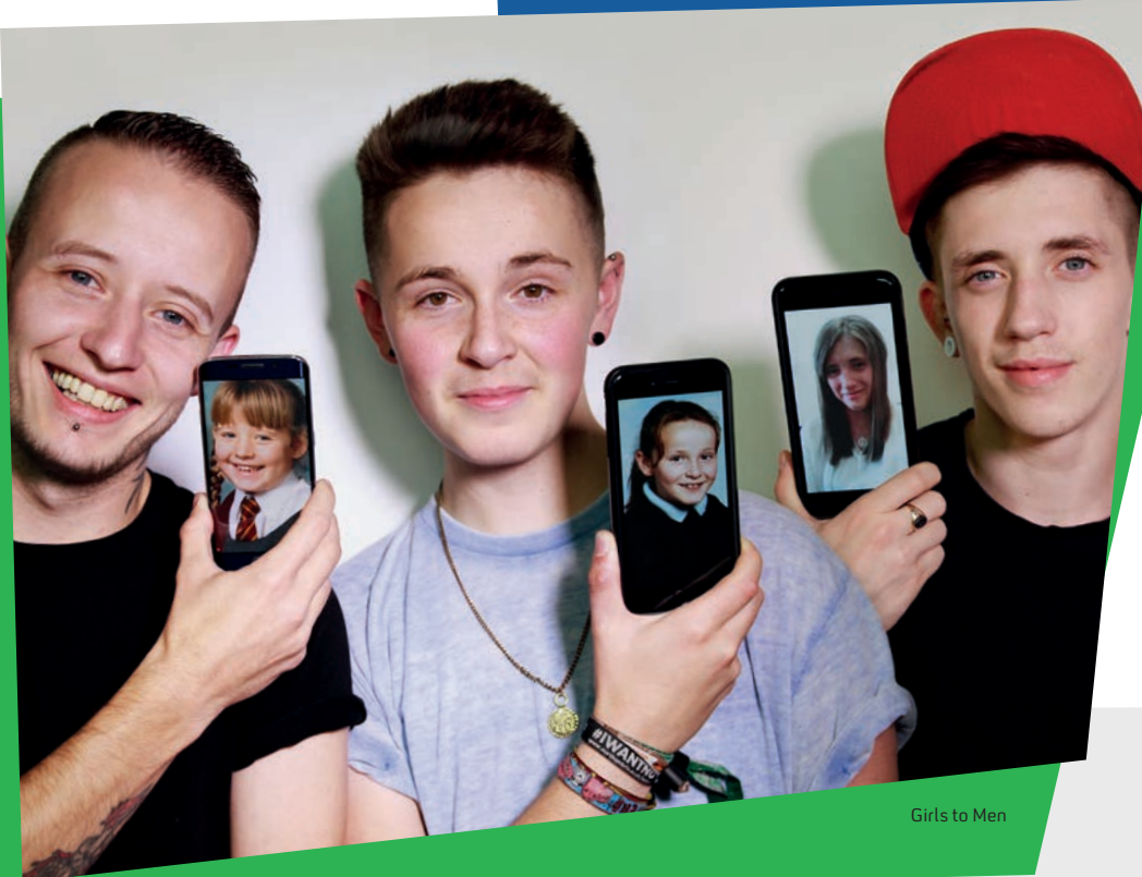
Girls to Men

We want our staff to feel that: They can be themselves, be different and be welcomed with open arms