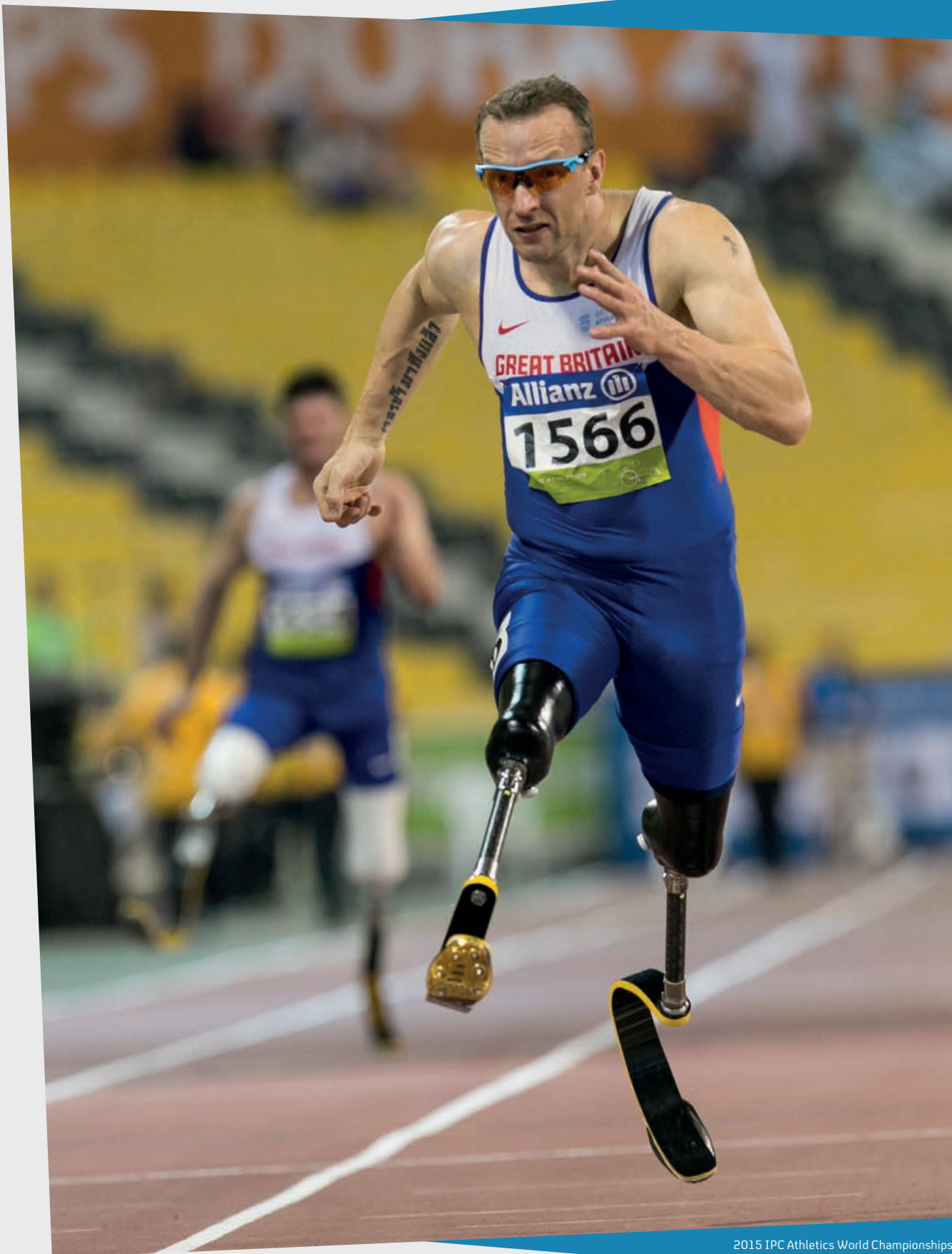
2015 IPC Athletics World Championships