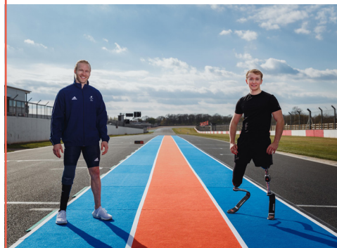
Billy Monger: Changing Gear

It is acknowledged that there may be limitations due to actors/characters in a storyline in these instances approval needs to be given by the Commissioning Editor.